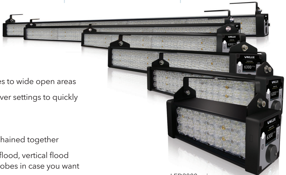
LED2000series (model 250 to 2500)